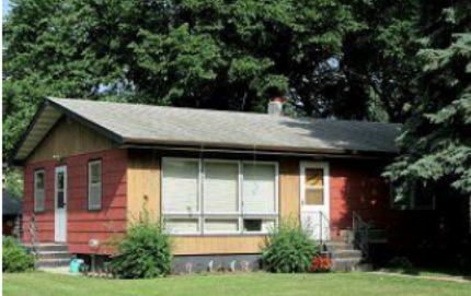
Pin 63-5860972 Photo

Parcel Number: 63-5860972 Deed Holder: Deed Holder 2: Contract Buyer 2: Property Address: 231 9TH AVE NE VALLEY CITY, ND 58072-0000 MAP THIS ADDRESS Zoning: R-2 FW&100 - 1 AND 2 FAMILY DWELLING FW & 100 FP Legal Description: N15' LOT 8 & ALL LOT 9 BLK 10 WEISER'S ADDITION